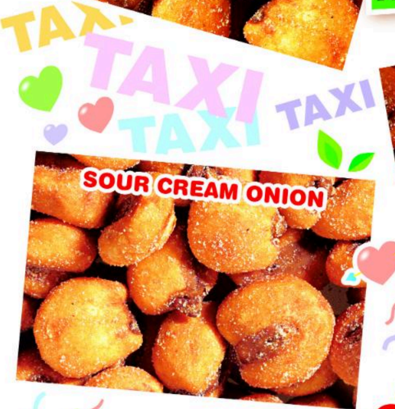
SOUR CREAM ONION