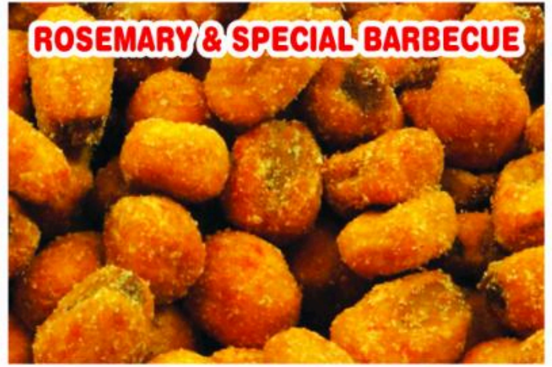
ROSEMARY & SPECIAL BARBECUE