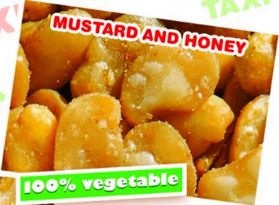
MUSTARD AND HONEY