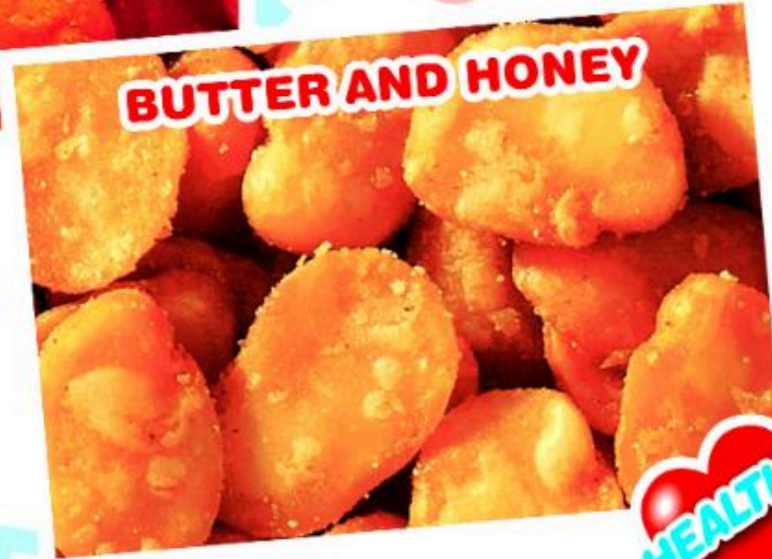
BUTTER AND HONEY