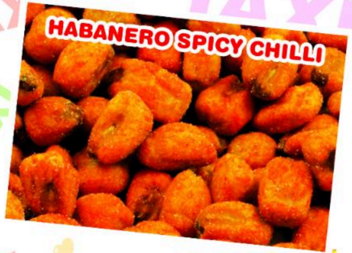
HABANERO SPICY CHILLI