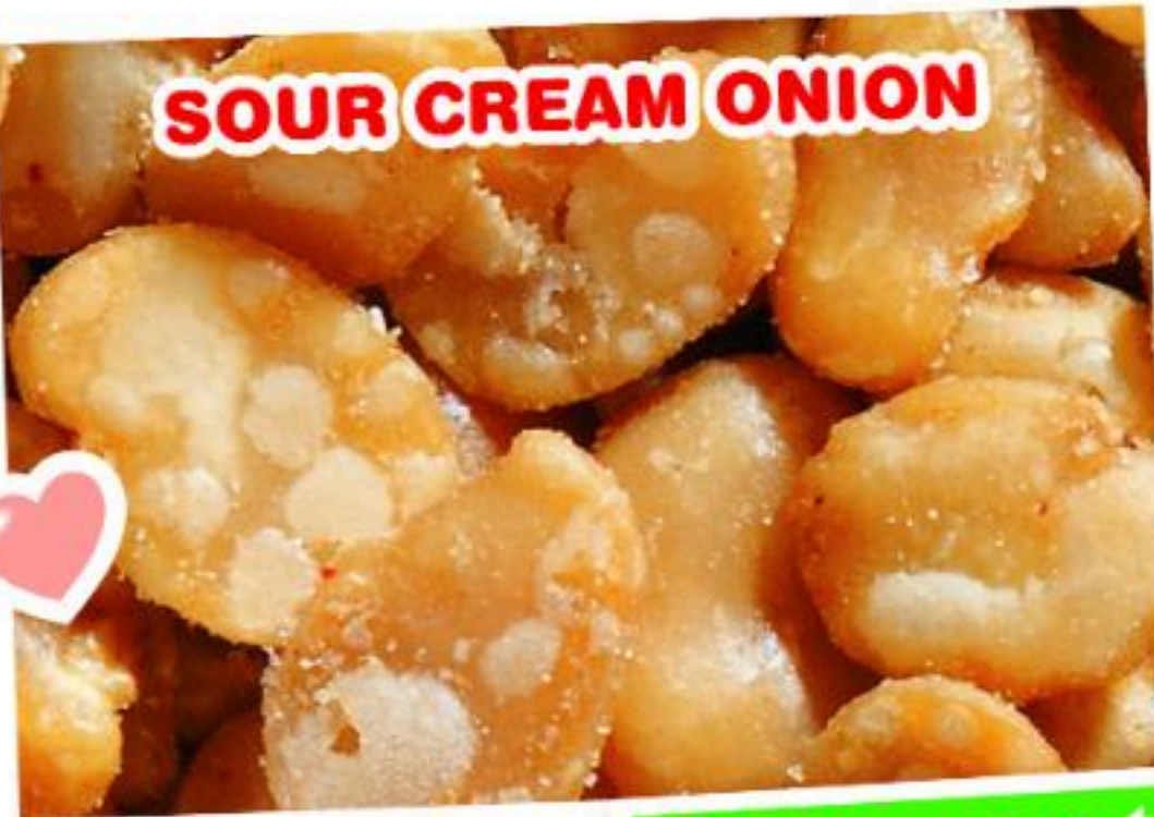
SOUR CREAM ONION