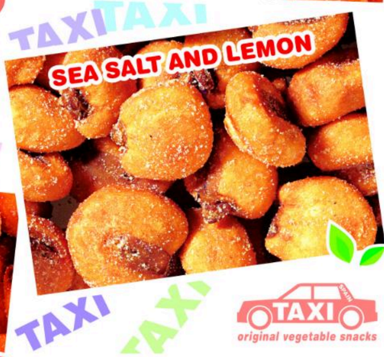
SEA SALT AND LEMON