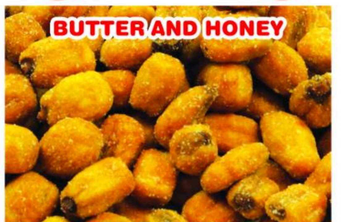
BUTTER AND HONEY