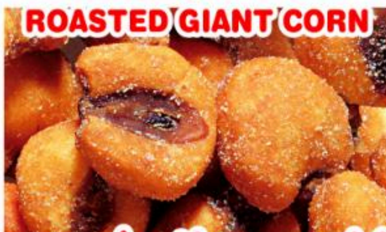
ROASTED GIANT CORN