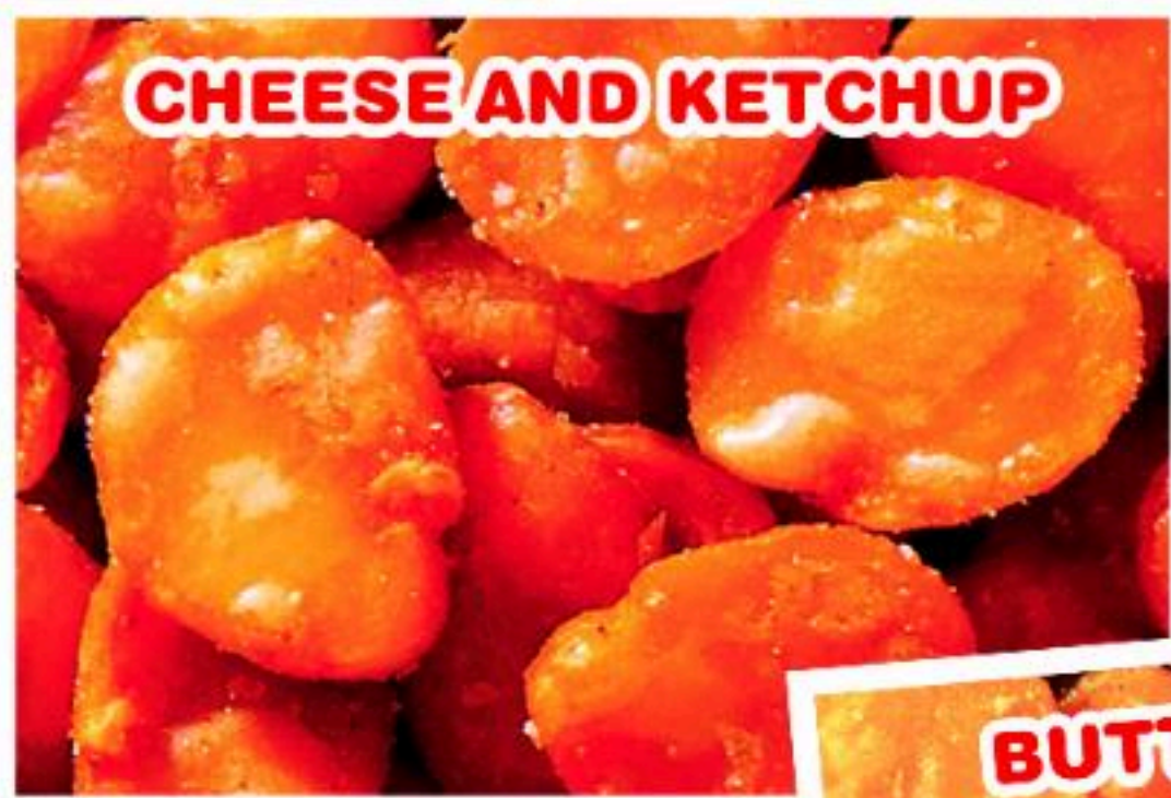
CHEESE AND KETCHUP