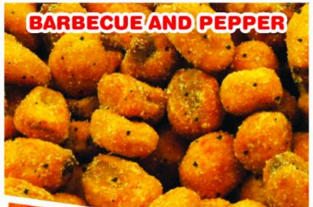
BARBECUE AND PEPPER