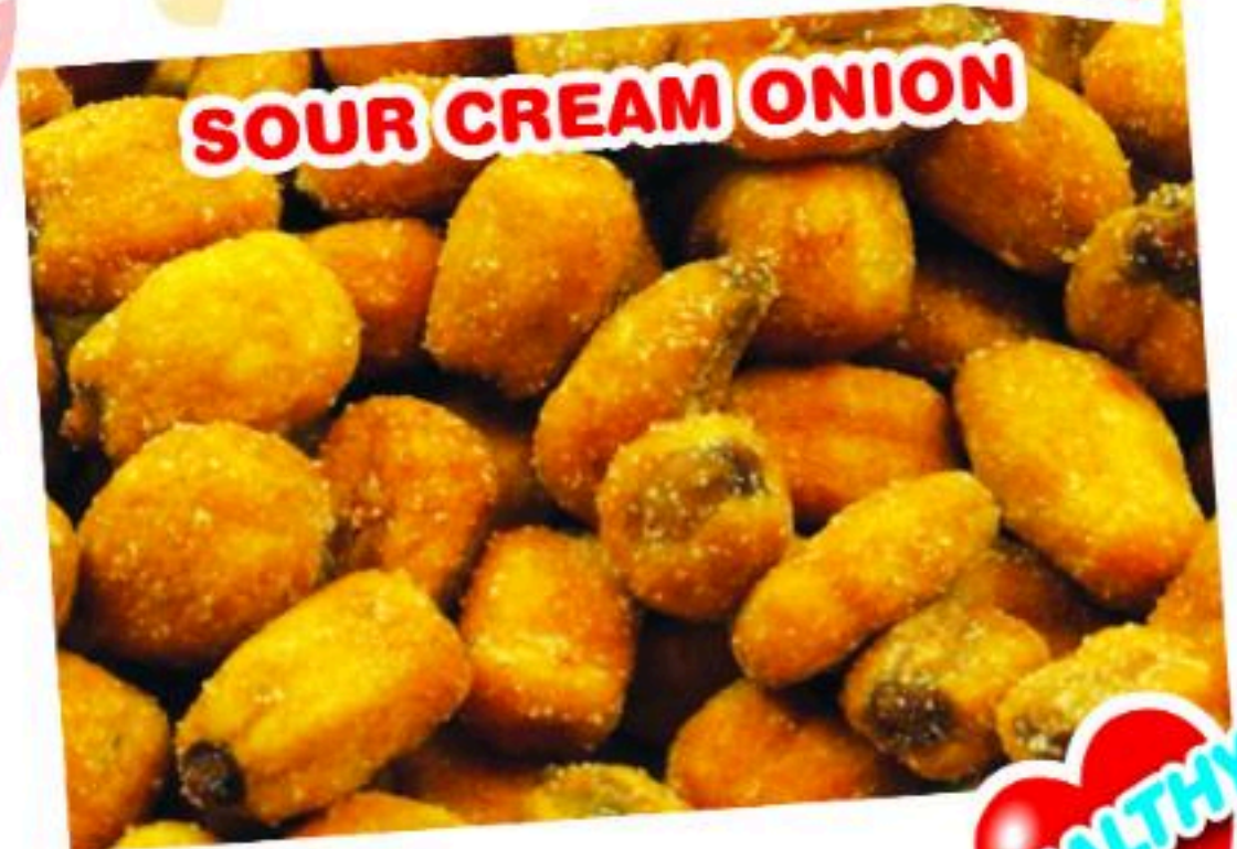
SOUR CREAM ONION