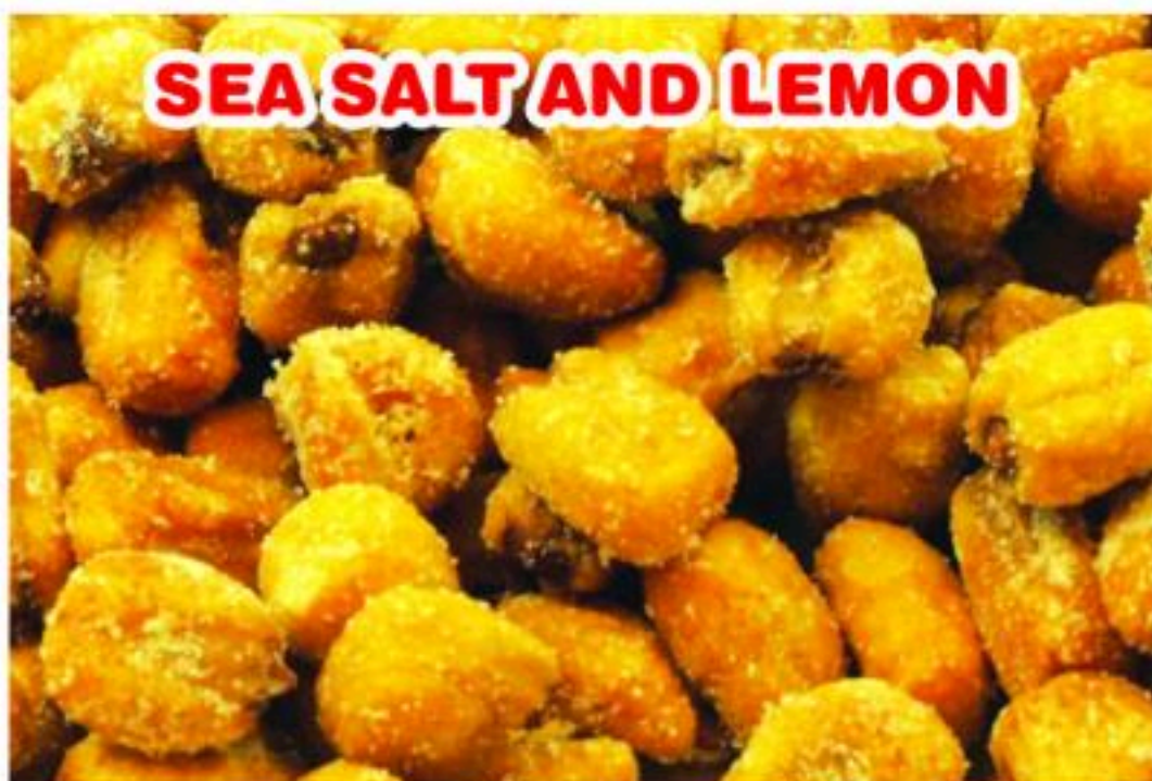
SEA SALT AND LEMON