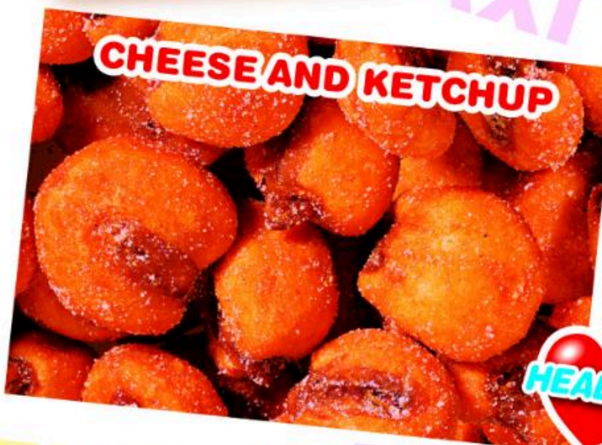
CHEESE AND KETCHUP