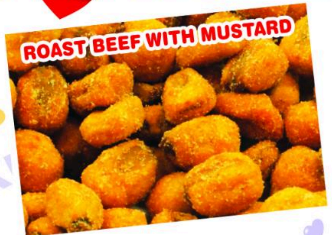
ROAST BEEF WITH MUSTARD