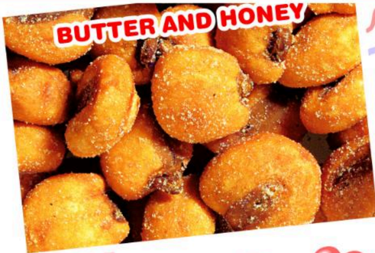
BUTTER AND HONEY