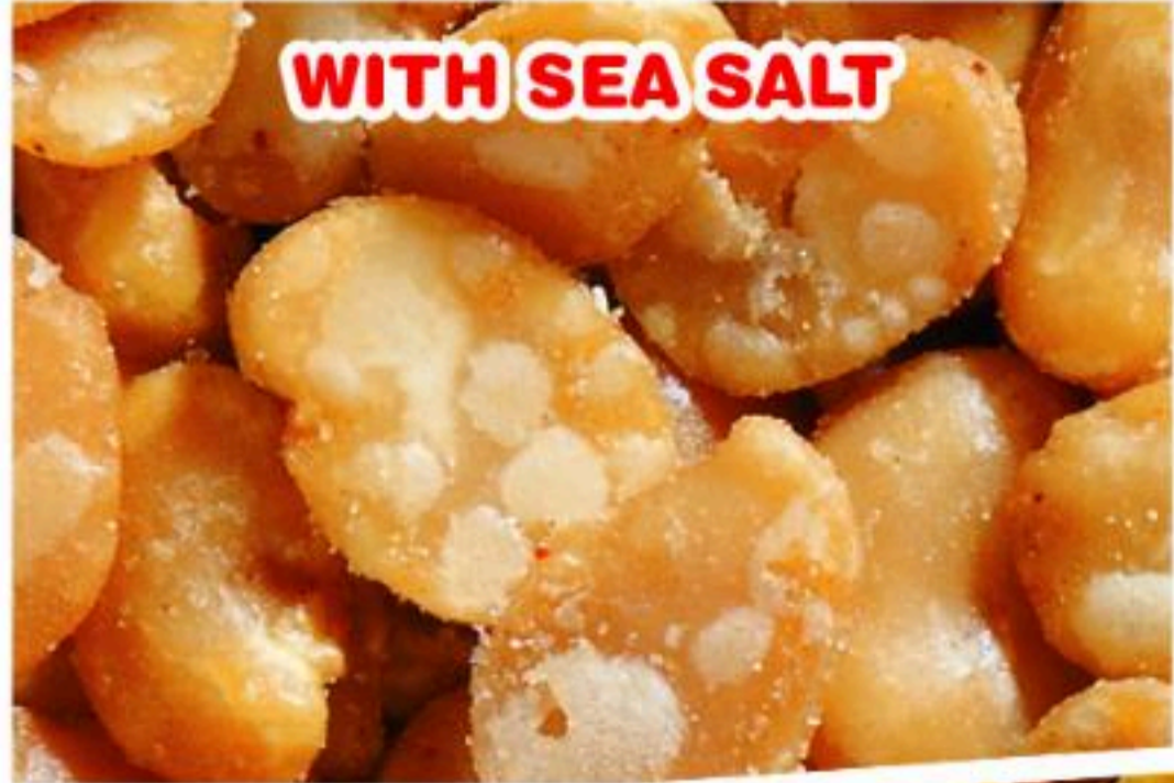
WITH SEA SALT