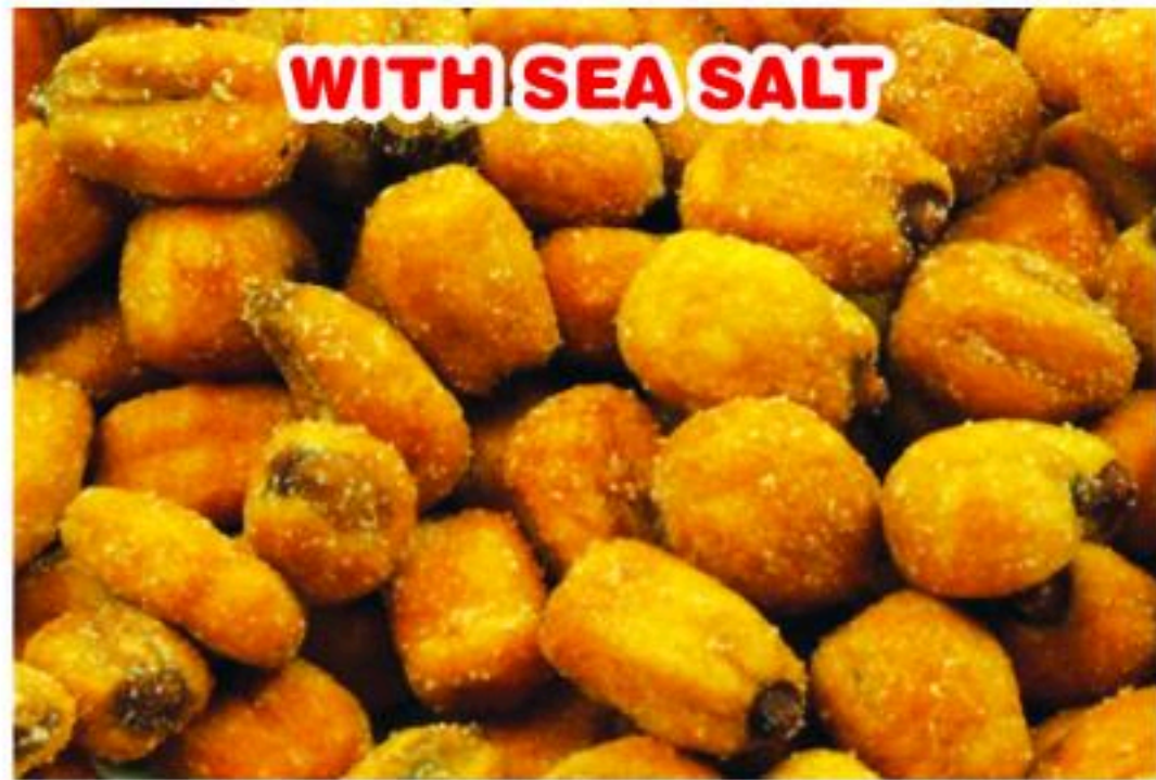
WITH SEA SALT