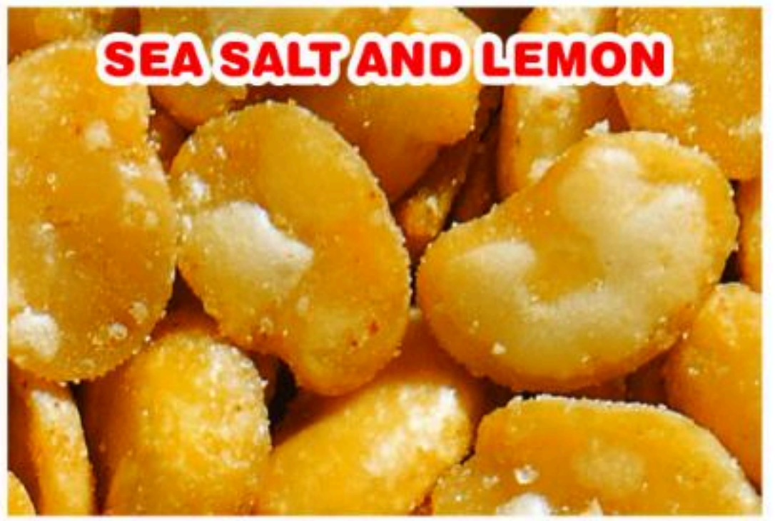
SEA SALT AND LEMON